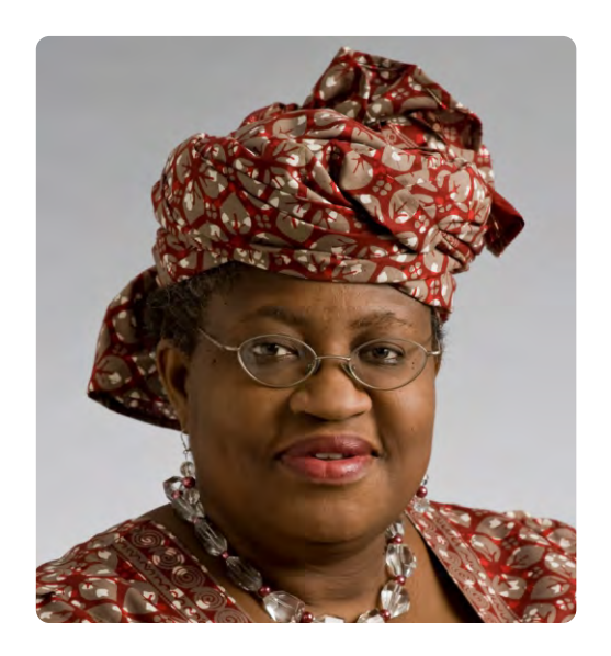
Hon. Dr Ngozi Okonjo Iweala Chair, ACBF Board of Governors

The year 2013 was an atypical one for African Capacity Building Foundation (ACBF) in many respects. The Foundation celebrated 22 years of shaping Africa's development agenda through its support of improved policymaking processes at a time when its own long term sustainability was challenged. A new way of doing business had to be adopted to balance steadily increasing demands from African countries for capacity building and a slow flow of resources due to delays in disbursements of pledges made by the Foundation's multilateral partners. For the first time, the Board of Governors (BoG) set up a permanent committee focused on resource mobilization. Operationalising this Committee remains one of the top priorities of the Foundation. Despite the challenges faced in 2013, including hard restructuring choices, I remain optimistic that 2014 will see us grow our capacity building initiatives in support of Africa's transformation drive.